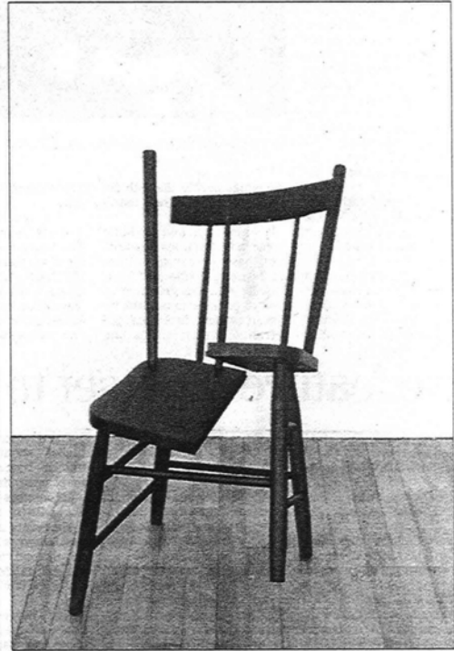
Two chairs are part of a loose-knit installation titled Four Corners , which also includes several drawers spread out on the floor and a dresser on its side.

Indeed, on one level, these untitled creations, of which the thin, patterned frames are an integral part, are about space, both literal space and the space that we conjure up when reading. Certainly, all texts ultimately have to do with existence in space or use spatial analogies.